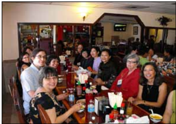
Lunch stop at Dong Phuong Restaurant and Bakery