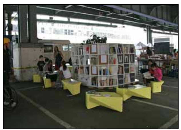
Uni at the New Amsterdam Market

I'll be meeting with the new start-up manager of a small cultural center planned for Boston's Chinatown, which will include books and library services. The seed of the collection? The 5000 books from the Storefront Library, which have been sitting in storage. I'll be sharing everything we learned from the Storefront Library to help ensure their success. Great news for Boston's Chinatown.